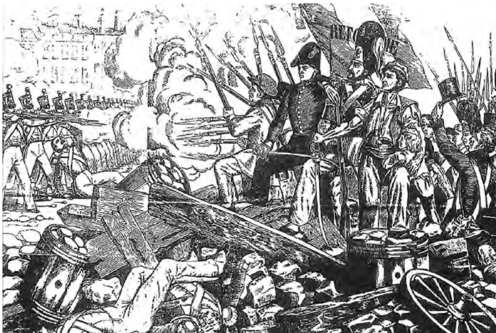
An artist's impression of the barricades constructed by the revolutionaries in France in February 1848.