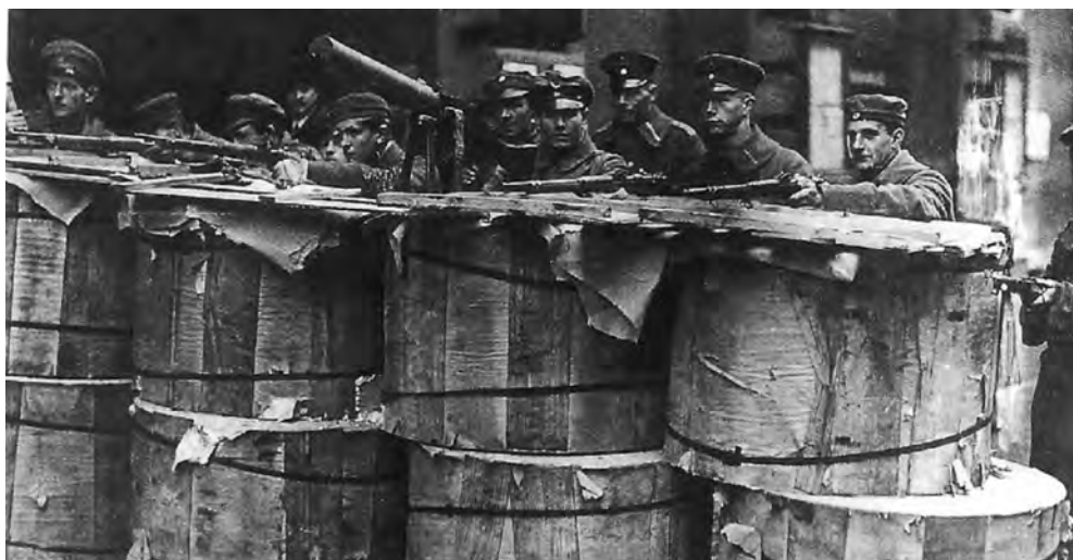
Spartacists defending the captured newspaper offices, 1919.