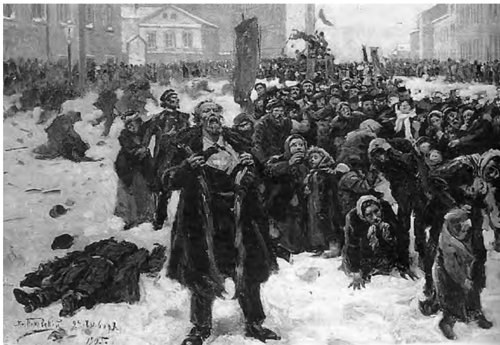
A painting of Bloody Sunday, produced around 1910.

11 Study the painting, and then answer the questions which follow.