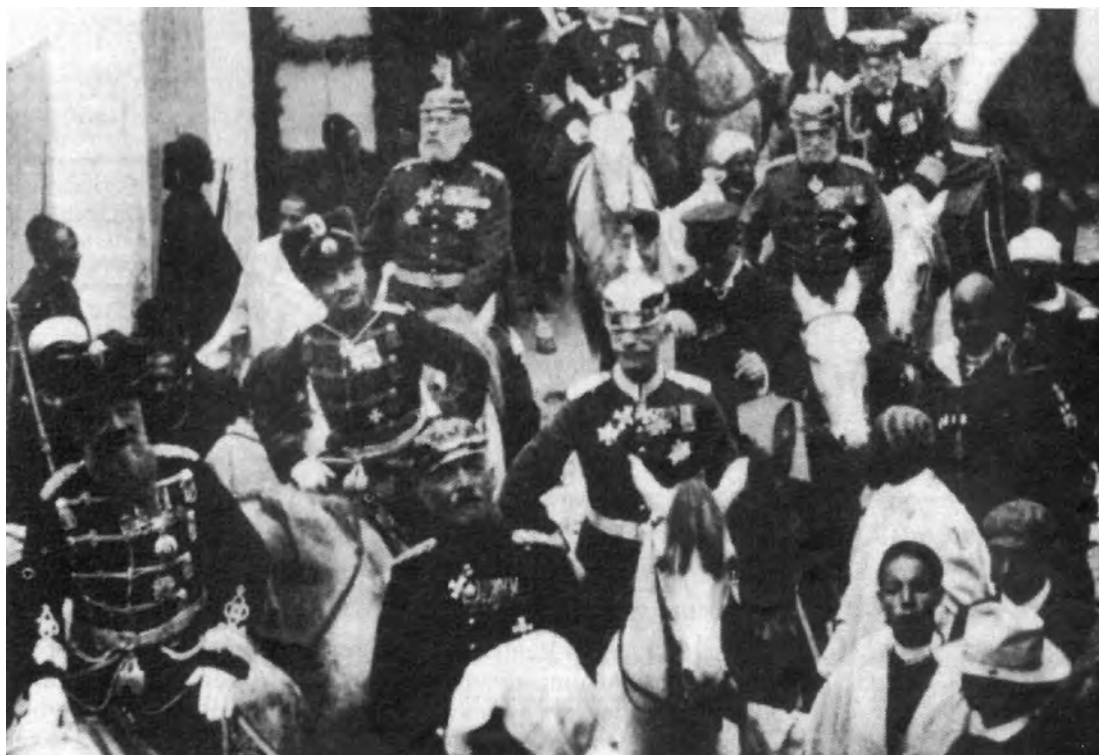
Kaiser Wilhelm II riding through Tangier in 1905.