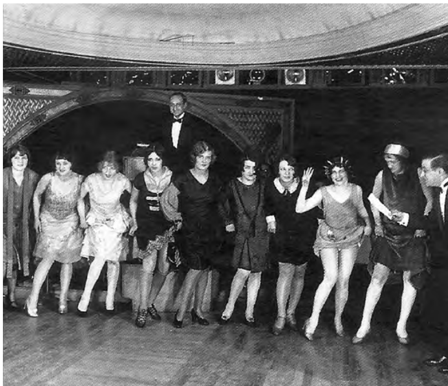
Flappers in the 1920s.

13 Study the photograph, and then answer the questions which follow.