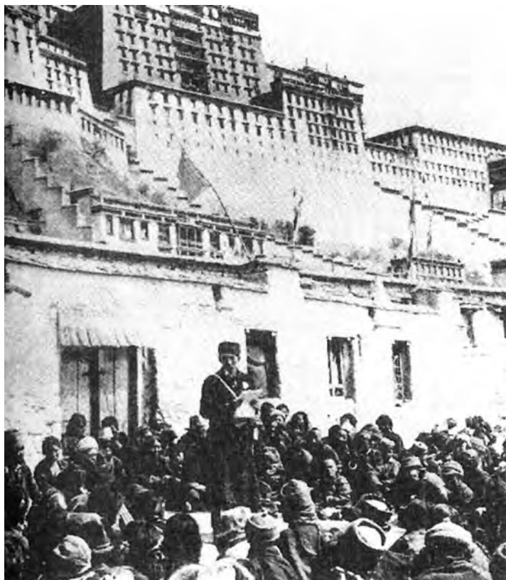
A Chinese Communist leader reads a proclamation to crowds of Tibetans in 1959.

15 Study the picture, and then answer the questions which follow.